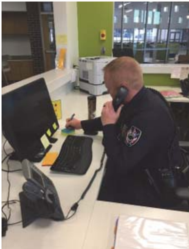
Left: Kelly Walsh's Safe Schools Officer applies the "next-man-up" philosophy as he answers the phone at Kelly Walsh High School.