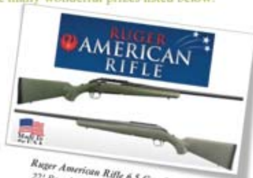
Ruger American Rifle 6.5 Creedmoor. 22" Barrel / 4+1 Capacity *Winner is subject to standard firearms background check. DONATED BY CHARLIE SHOPP @ RE/MAX