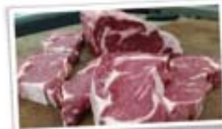
TWO WINNERS! Brattis Meat Bundle. 25lbs ground chuck / 2 Ribeyes / 8 NY Strips / 8 Steaks / 1 Rack Beef Ribs / 5 Roasts